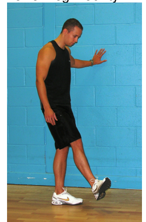
Lower Leg Mobility